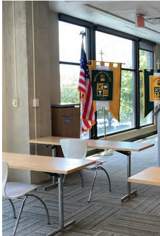
TRAINING FACILITY Ceiling Panel & Tower with Custom Finish Installations