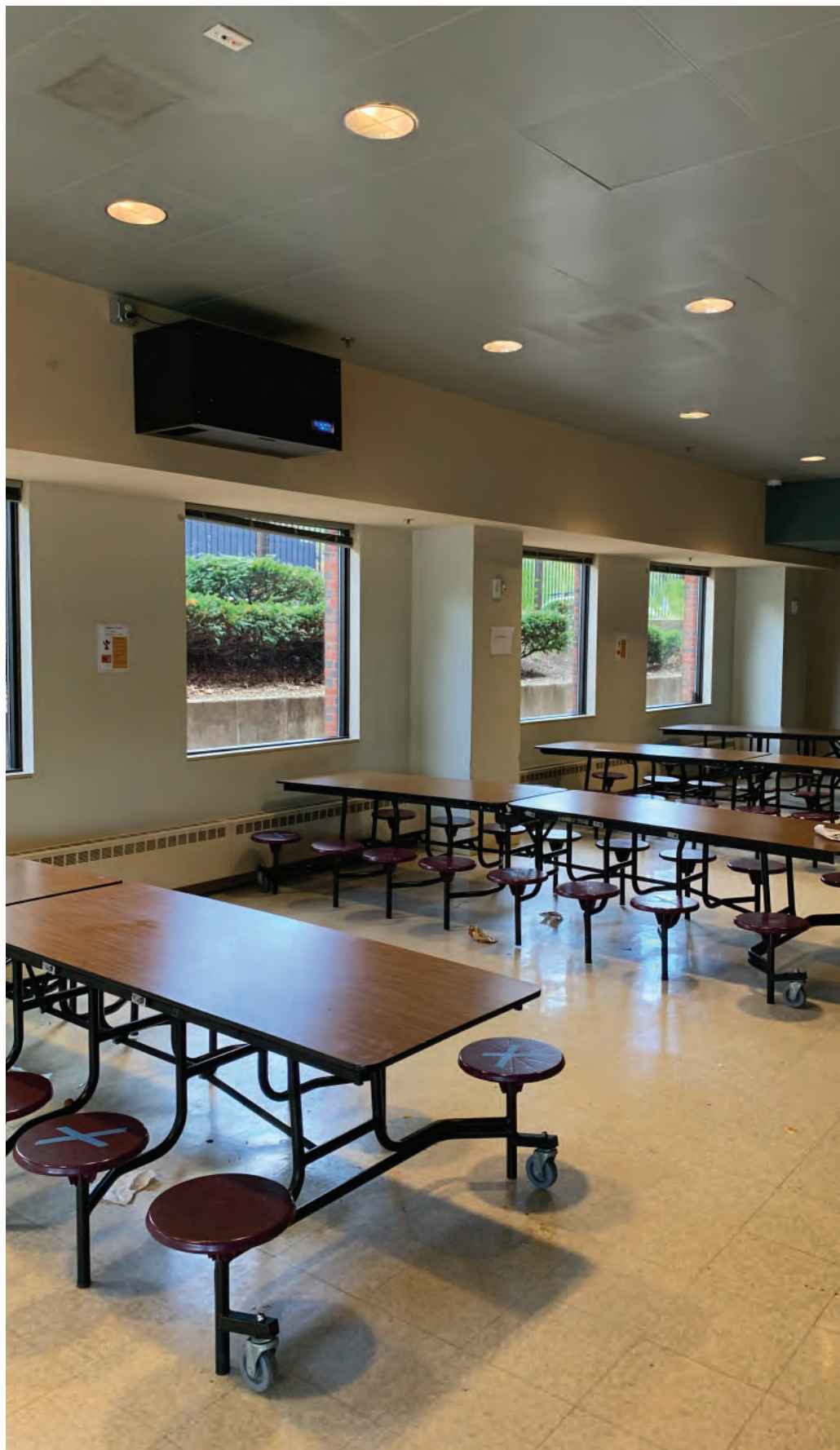
CAFETERIA Wall Enclosure Installation with Custom Finish