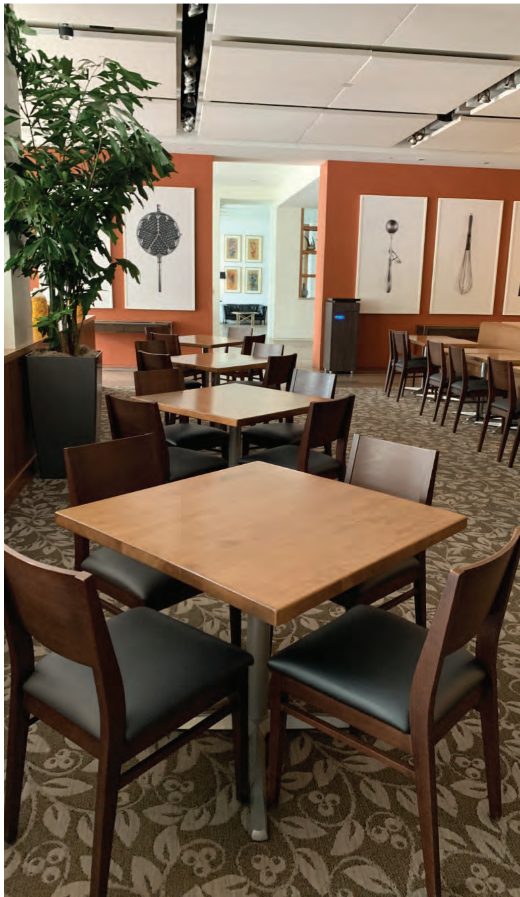
RESTAURANT Tower Installation with Custom Finish