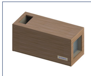
Wall mounted shelf enclosure conceals unit and optimized airflow.

Bluezone® by Middleby makes indoor dining and working spaces safe again with patented, ultraviolet air cleaning technology that kills up to 99.9995% of viruses in the air, including SARS-CoV-2 (corona-virus). Air is pulled into a chamber, is scrubbed of contaminants, and purified air is returned to the space.