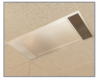
Ceiling Mount Kit replaces 2 x4 drop ceiling panel.