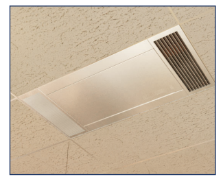
Ceiling Mount Kit replaces 2 x4 drop ceiling panel.