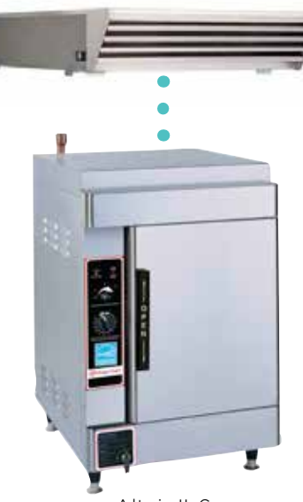
Altair II-6 VEGA Condenser Hood 92-1008 (Altair II 4 & 6 pan ONLY)

Market Forge's Optional Ventless VEGA Condenser Hood allows you to cook anywhere. The VEGA Condenser Hood works by reducing the steam output, allowing you to steam without the use of a hood system.