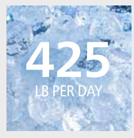
Powerful Up to 425 lb of ice per day – over 17.5 lb per hour – of Chewblet ice production