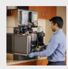
Modular 25, 50, and 110 Series all feature removable ice modules for ease of service