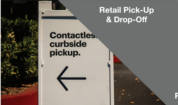
Retail Pick-Up & Drop-Off