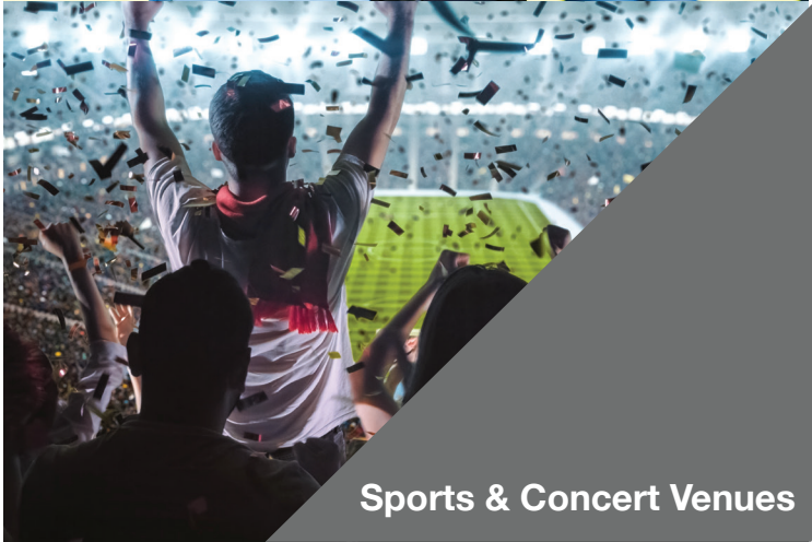
Sports & Concert Venues