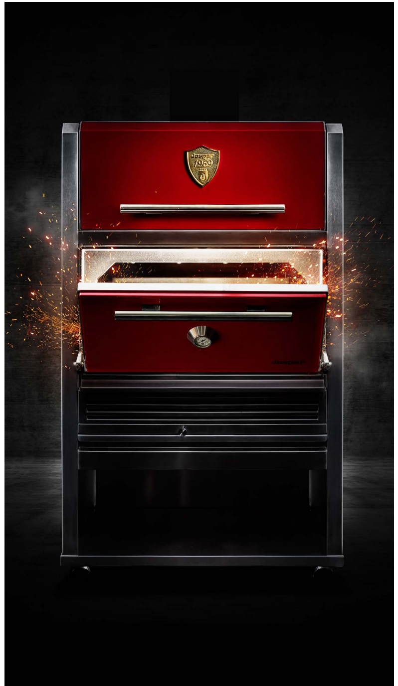
Jospo Charcoal Broiler Oven HJA-PLUS-L175