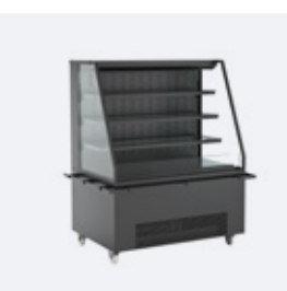
REVEAL NR3655RSSA.MOB Mobile

Mobile refrigerated self-service displays on casters use less floor space by displaying product vertically instead of horizontally and can be easily pushed up against shelving, walls, columns, or used back-to-back.