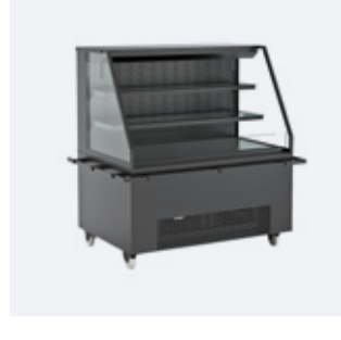
REVEAL NR3647RSSA.MOB Mobile