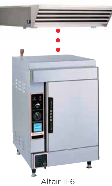
VEGA Condenser Hood 92-1008 (Altair II 4 & 6 pan ONLY)

Market Forge's Optional Ventless VEGA Condenser Hood allows you to cook anywhere. The VEGA Condenser Hood works by reducing the steam output, allowing you to steam without the use of a hood system.